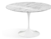
Saarinen Lounge Table Round 35¾", 42¼"W x 26"H