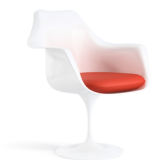
Tulip™ Arm Chair 26"W x 23¼"D x 32"H