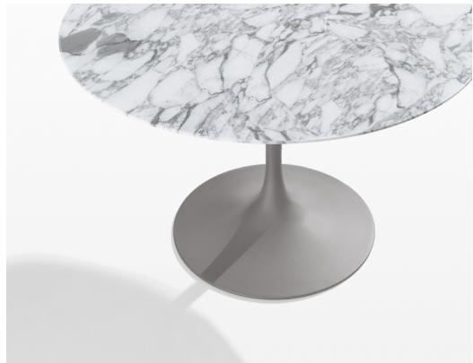
Saarinen marble table tops in Arabescato, Nero Marquina, Espresso, and Verde Alpi (right), Arabescato table top and Tulip Chairs and stool (below)

an elegant round or oval top with a refined, knife edge. This is accomplished through a unique base construction and materials that provide exceptional strength and fluidity.