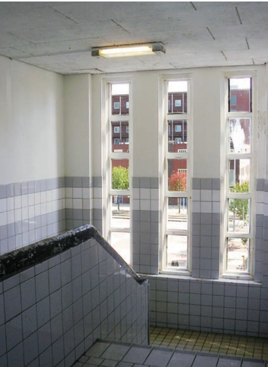
Renovations in the 1980s included the addition of acoustic ceilings and tiling in the original staircases.