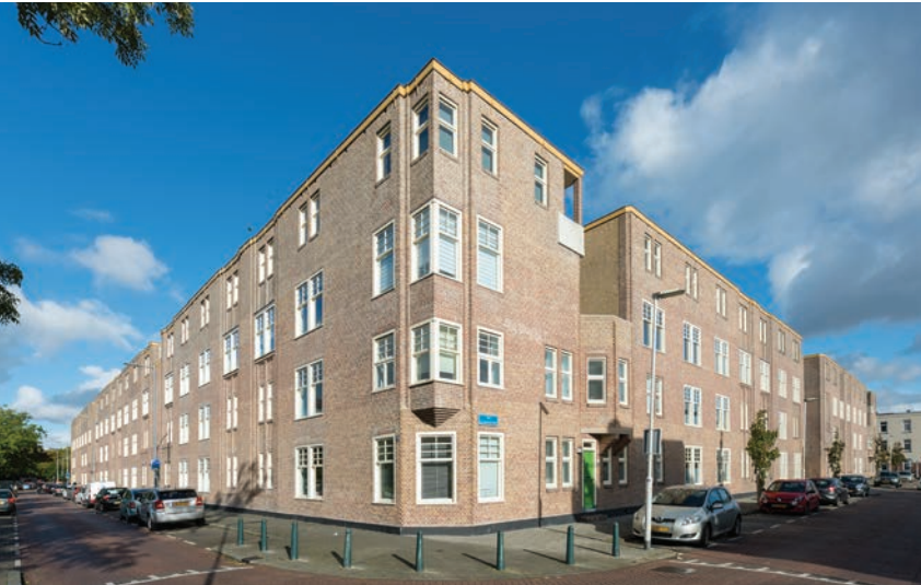
The comprehensive project addressed all levels, from the building fabric to the public domain and wider urban context, of the Justus van Effen complex.