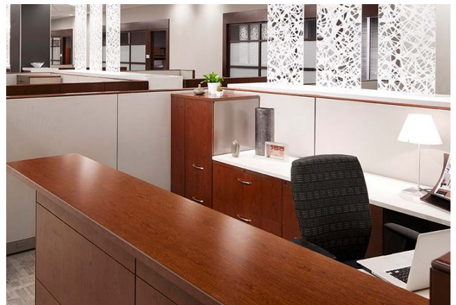
Reff Profiles workstations in AdventHealth's first structure which housed administrative leadership staff, which opened in 2009.