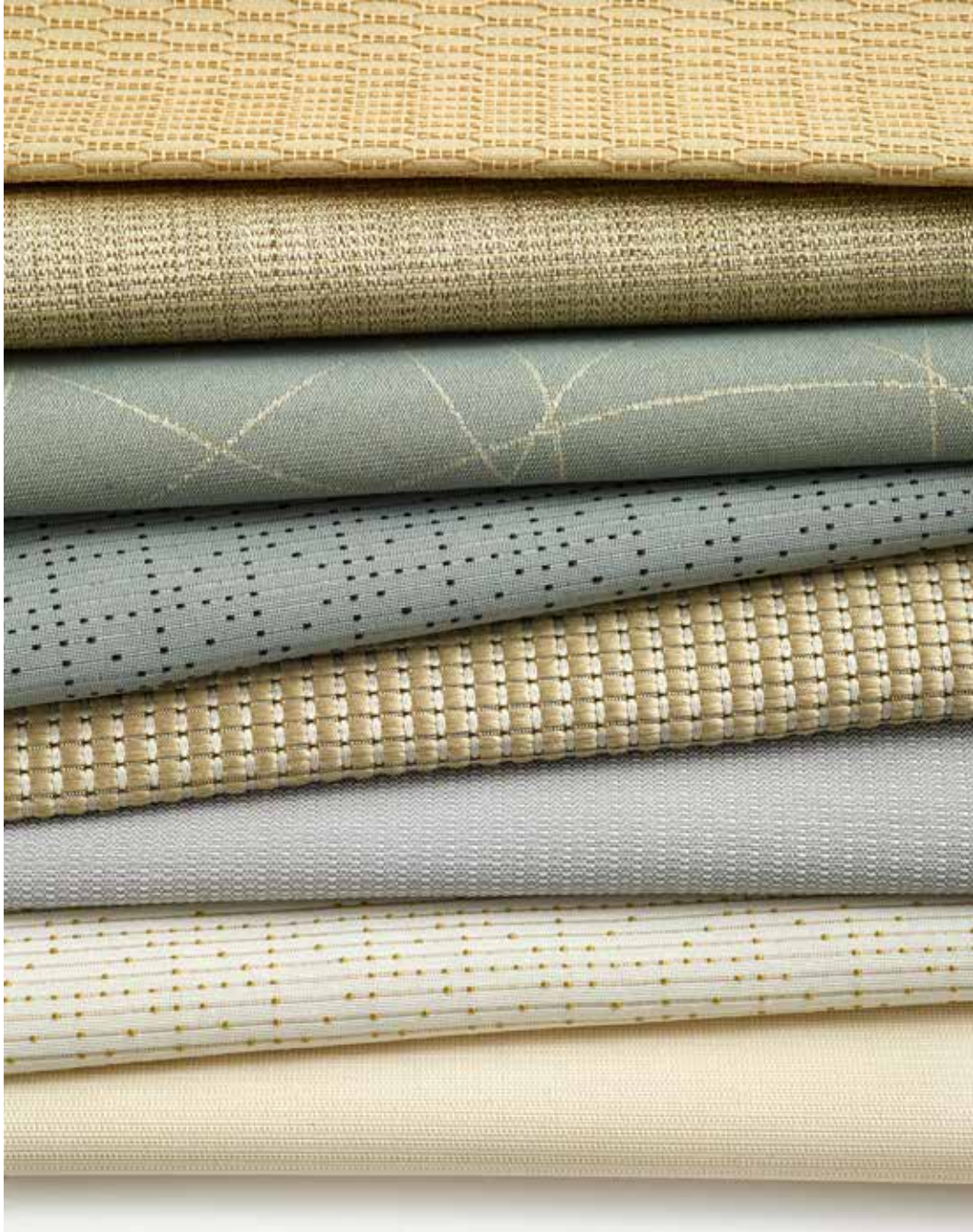
Bandwidth, Antares, Circle Line, Mainframe, Macro, Skylark, Mainframe, and Beacon Panel by KnollTextiles