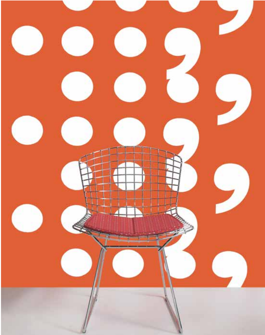
Pause Wallcovering by KnollTextiles