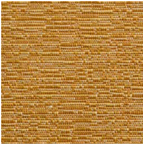
Express by KnollTextiles exemplifies a wallcovering with a dry hand.

Wallcovering fabric with a dry hand is typically matte and is woven using conventional yarns. These conventional yarns may be intermixed with novelty yarns, including bouclés and chenilles. Typically, wallcoverings woven with natural fibers will have a dry hand. Depending on its yarn characteristics, fabrics woven with man-made fibers may also have a dry hand. Depending on its color, wallcovering fabric with a dry, matte appearance may absorb light within a space.