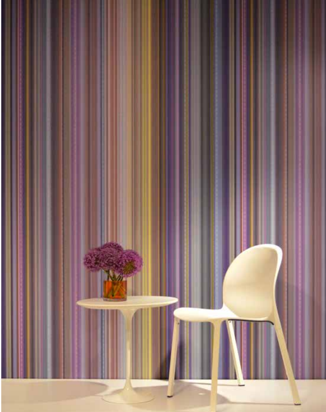
Peninsula Wallcovering by KnollTextiles