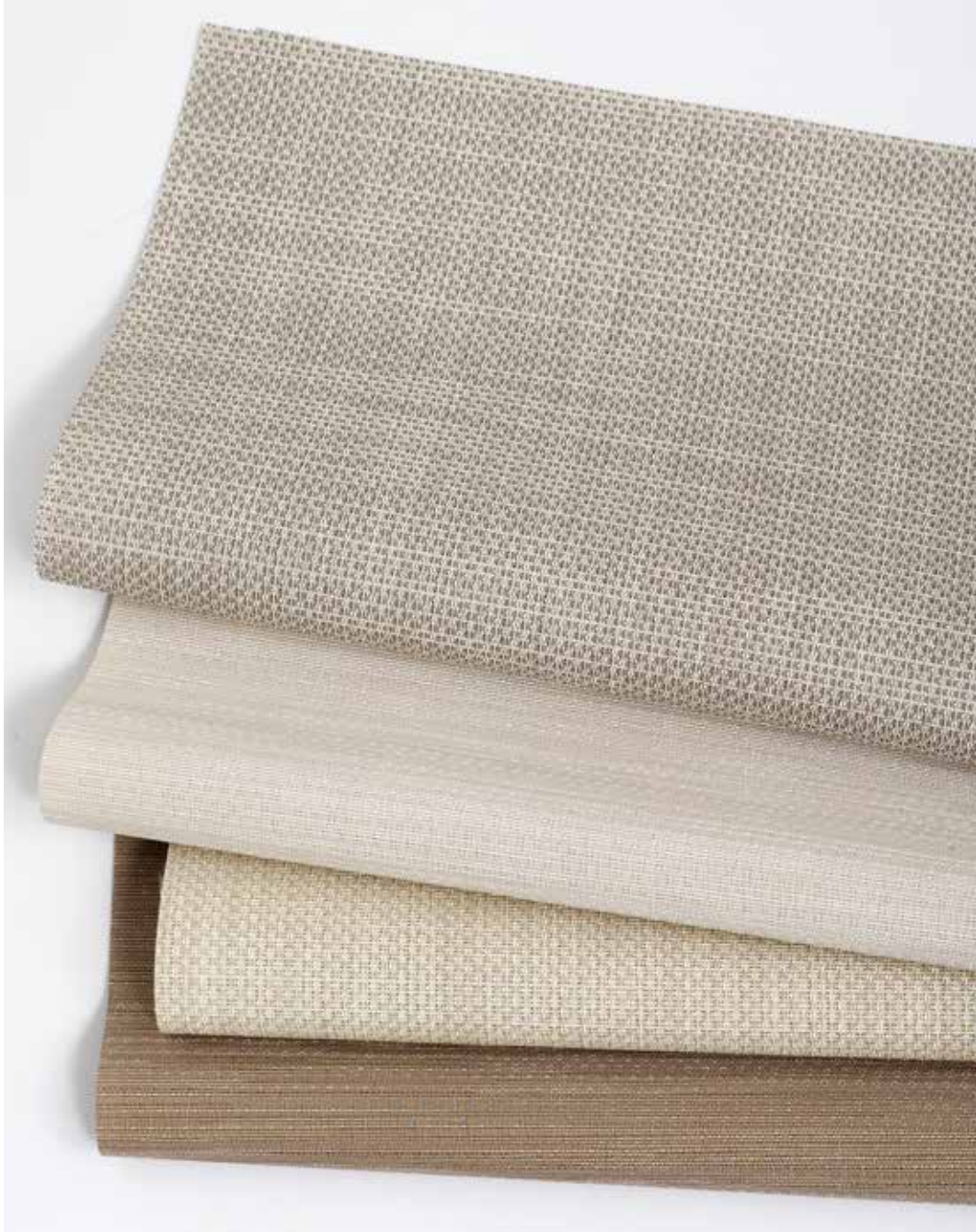
Repertoire and Intermission Wallcovering from the Screenplay Series by KnollTextiles