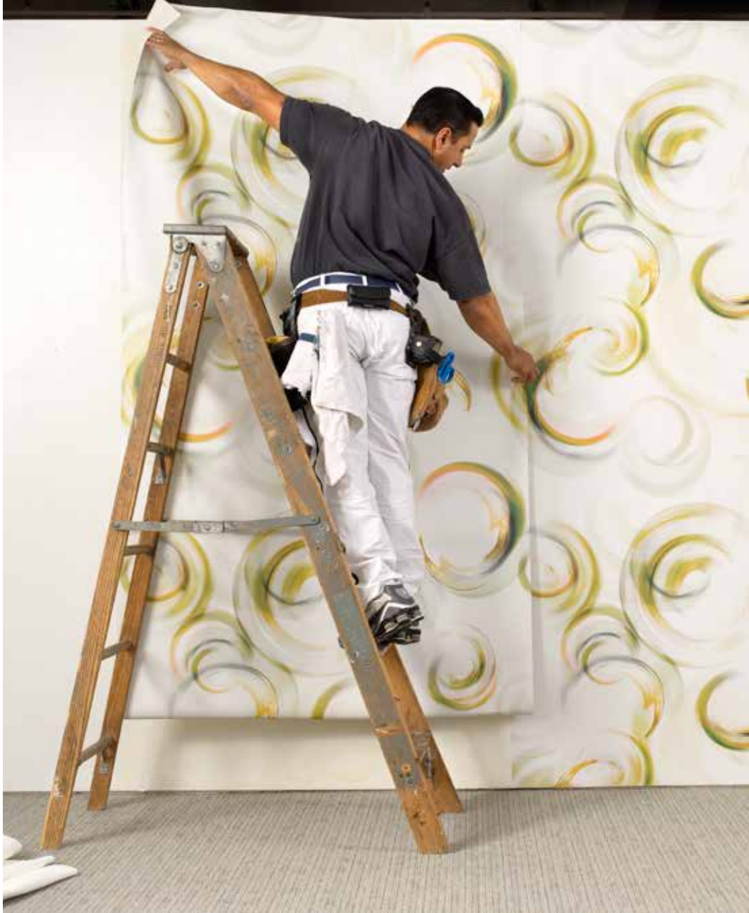
Wallcovering installer shown matching the seams of Swerve Wallcovering by KnollTextiles