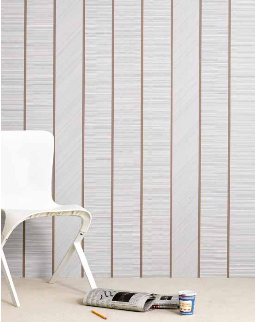
Borderline Wallcovering by KnollTextiles