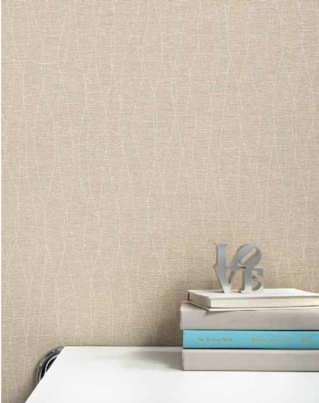
Shortwave Wallcovering by KnollTextiles