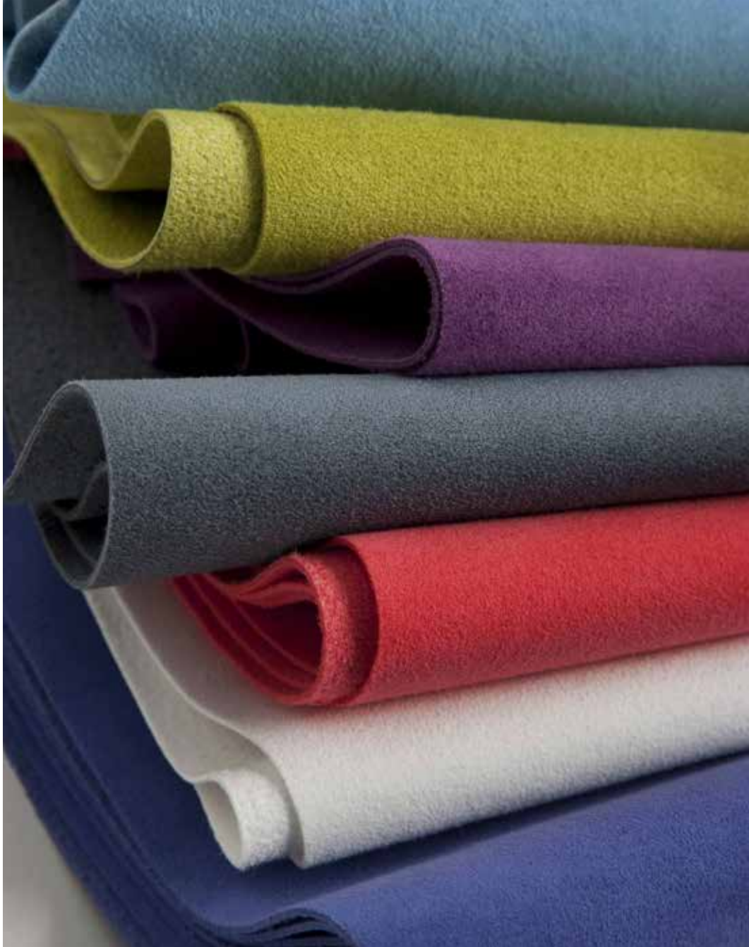
Ultrasuede by KnollTextiles can be used for acoustical panel or wallcovering applications