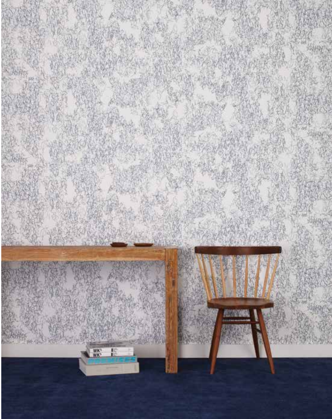
Run Wallcovering by KnollTextiles