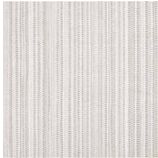
Archer by KnollTextiles exemplifies a wallcovering with a wet hand.

Wallcoverings with a wet hand are often woven with tape yarns that may have a metallic element or may be finished in a way that makes them reflective. The reflective quality of these products may generate more light and life within a space. These products are a good solution if there are environmental restrictions placed on excessive lighting.